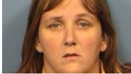
Mugs in the news