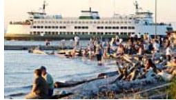
Your travel photos