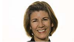
Need advice? Ask Amy